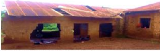
Kabongezo Primary School, Kikandwa