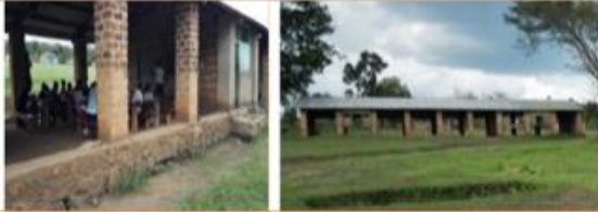
Picture showing the classroom without a wall Picture showing the classroom without a wall Kiryookya CU Primary School, Kalangaalo Sub-County