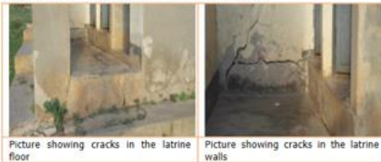
Picture showing cracks in the latrine floor Picture showing cracks in the latrine walls While the latrine was seriously damaged; it was still being used. This is risky to lives. Kawolongojjo Primary School, Namungo Sub-County