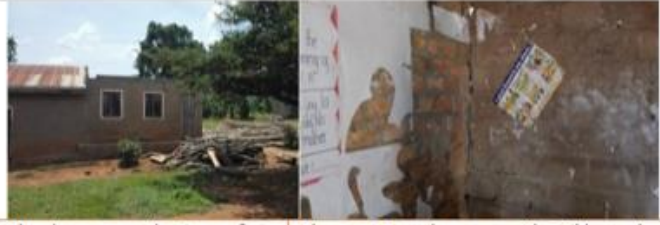
The classroom without a roof Bulera CU Primary School, Bulera Sub-County The remaining classroom with visible crack.