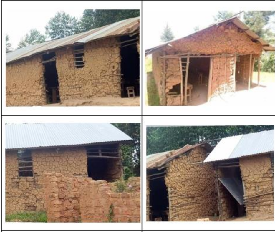
Mulungu Primary School, Rwanyana, Ndorwa West, Kabale District