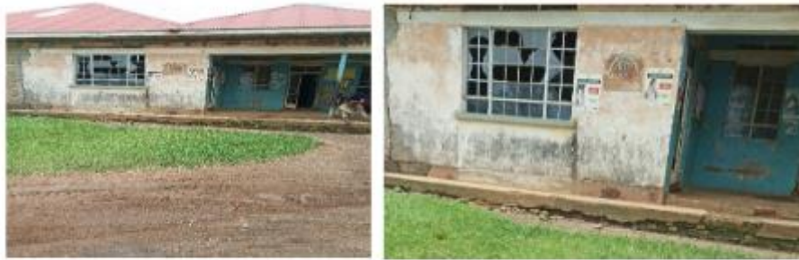
Bukulula Health Centre IV Out-patients Department