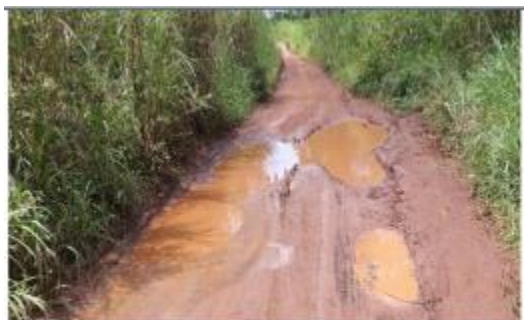
Immense potholes around Kigona village