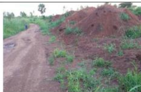
Stock piles of murrum along the road