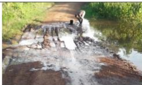
Poor road status (unimplemented drainage works)

Delayed completion of Karuma –Okwece Road: Only 10Km out of the planned 16Km had been worked on.