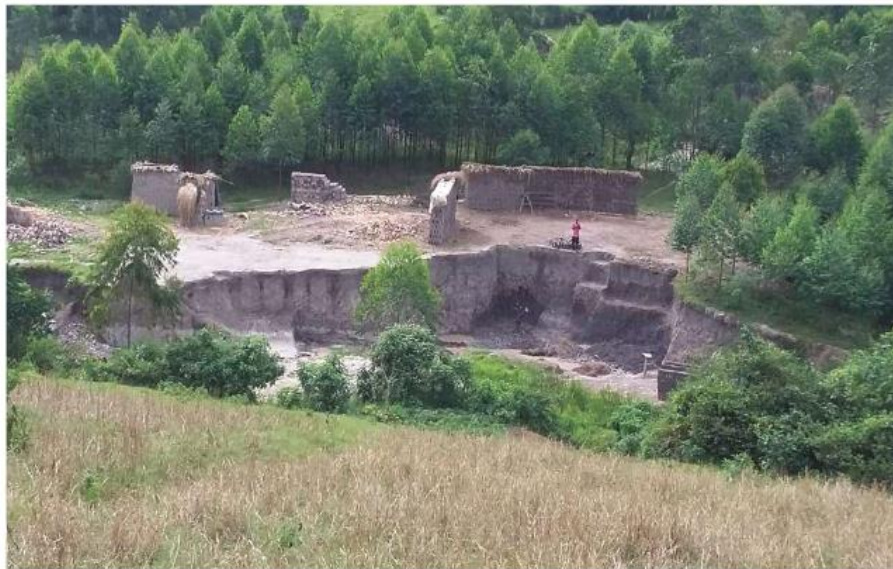
Plate 10: Brick making pits in Ikuniro village, Buhunga Sub-county

Causes: unregulated sand-mining, brick-making, waragi distillation in the wetlands